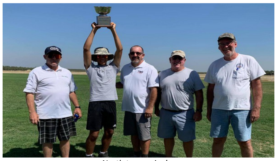
North team wins!