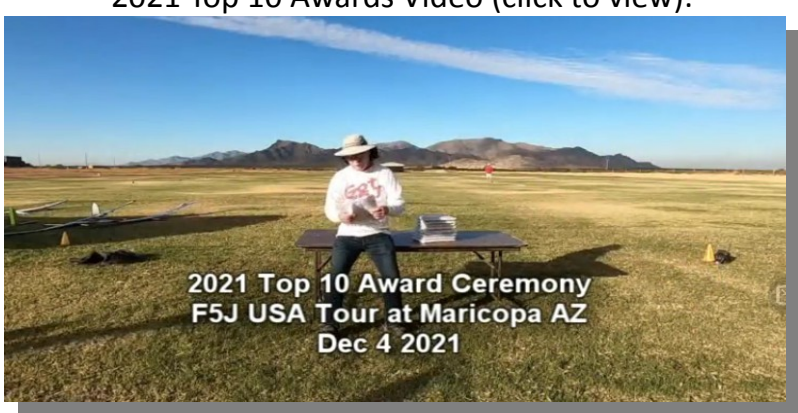
2021 Top 10 Awards Video (click to view):