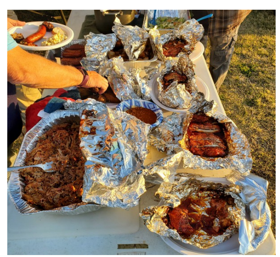
"It's all about the food!"