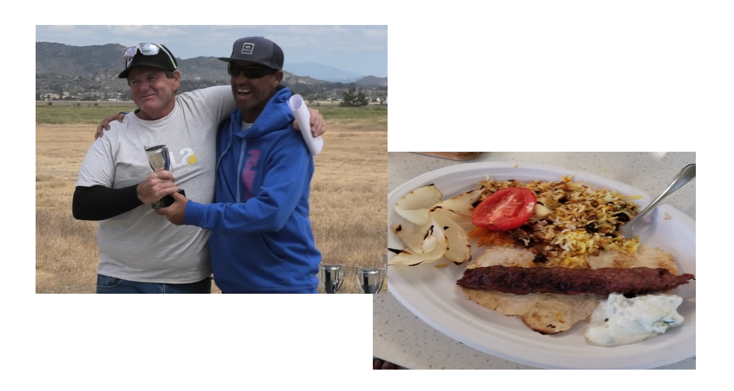
BRASS F5J in VA - May