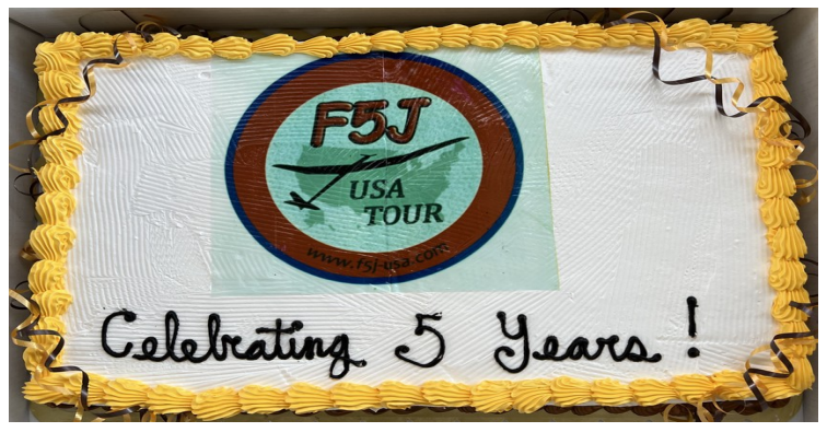
5 year anniversary cake at the 2021 Top 10 Awards ceremony in Maricopa AZ, Dec 4 2021

Looking at the pilot increase from 2019 to 2021 even with the hit we took in 2020 the annual effective increase works out to 25% a year. Yes the Tour is still growing.