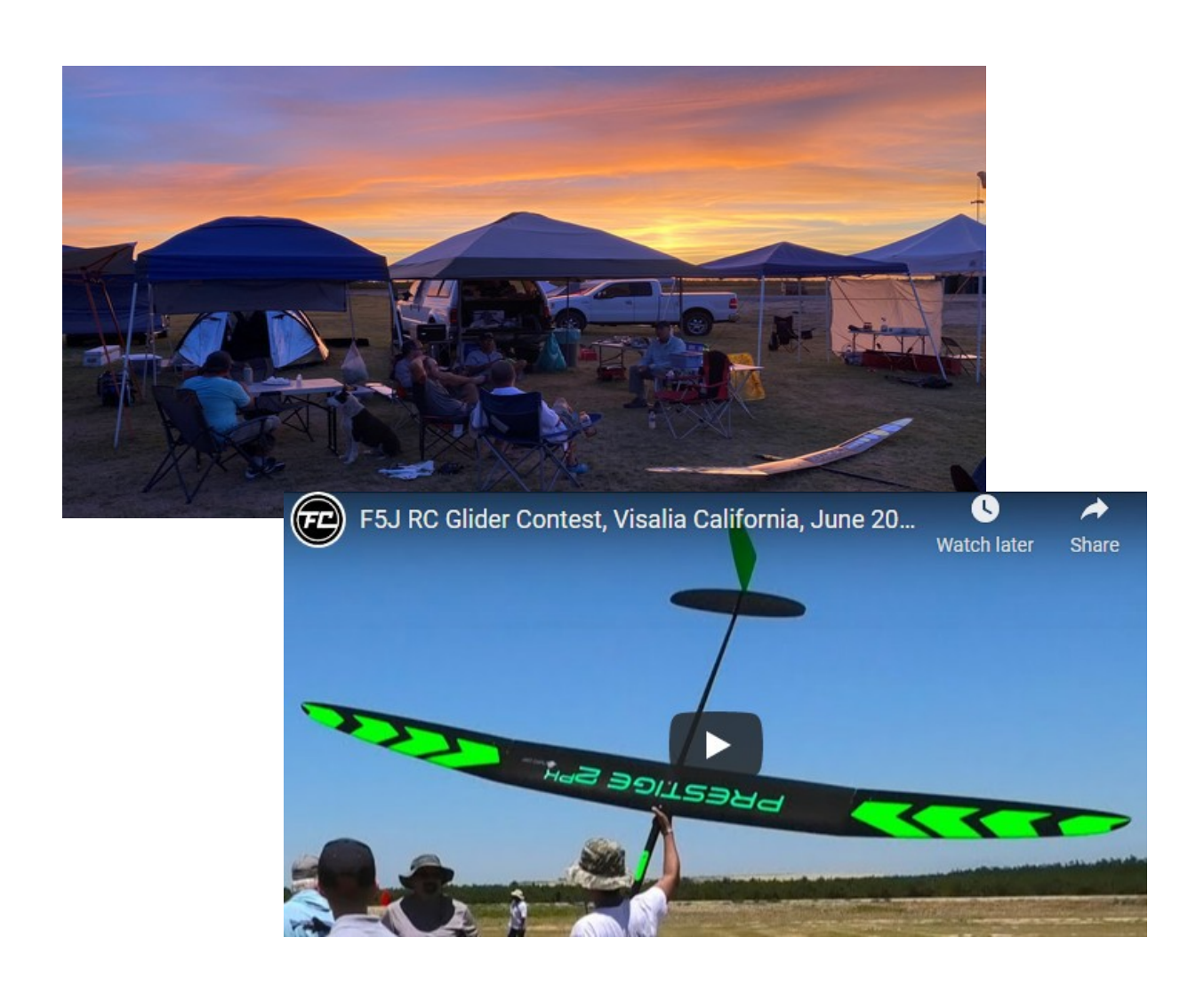
House Mountain F5J in TN - June