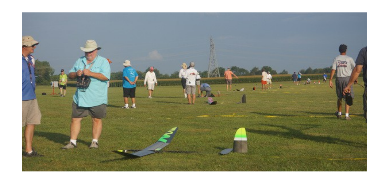
North/South F5J Challenge in Visalia - Sept