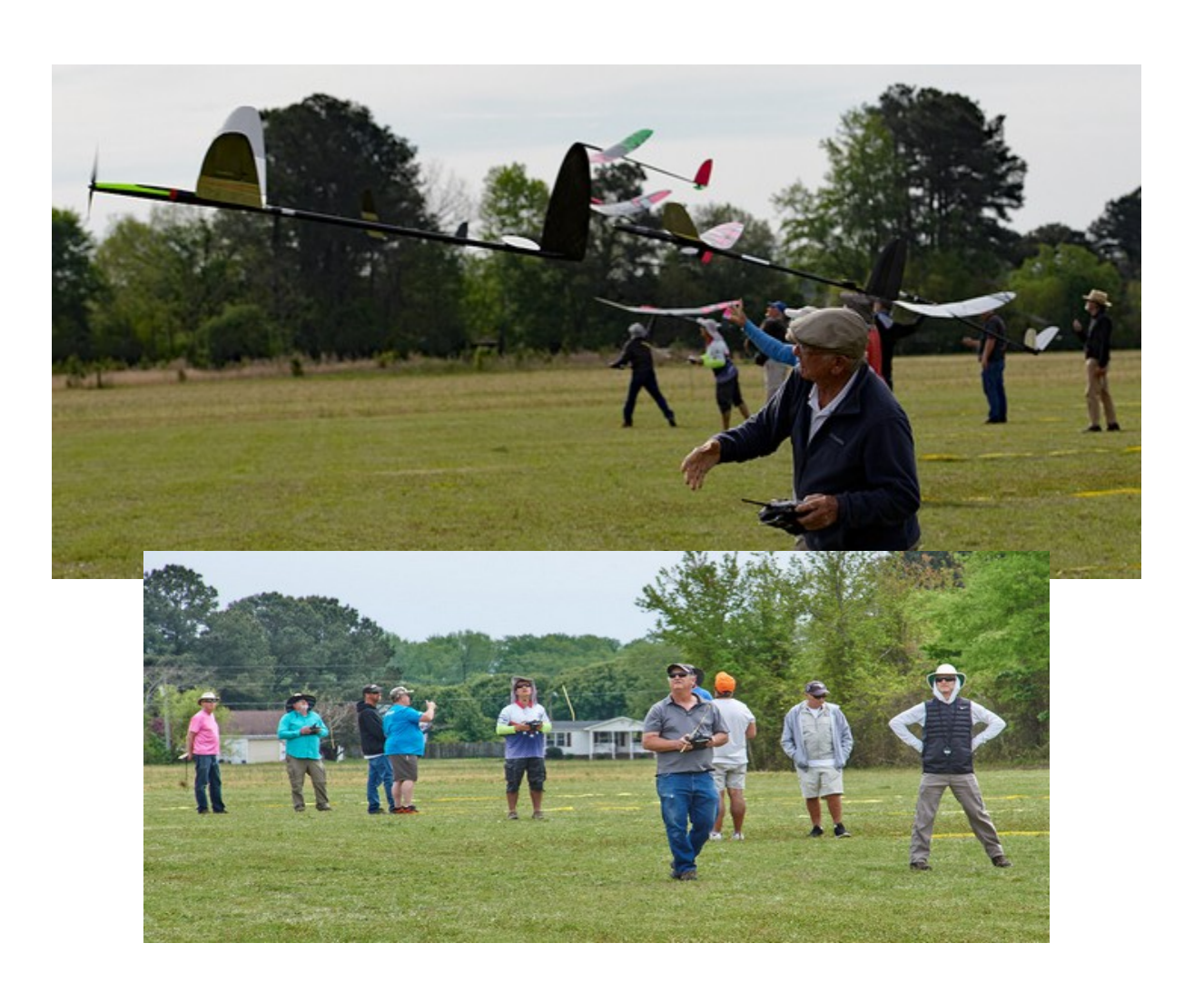
California versus AZ + Friends - Perris CA - April