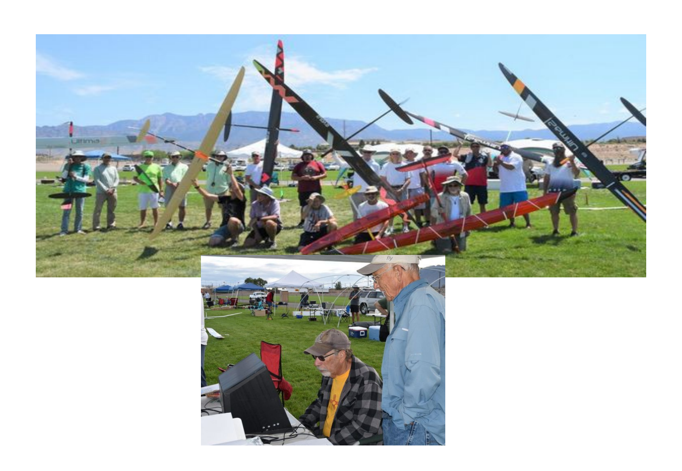
NATS F5J in Muncie IN - August