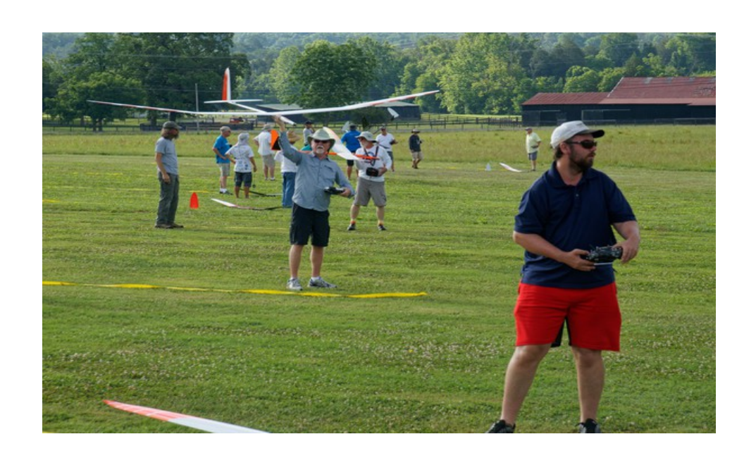
F5J in the Rockies in Denver - July