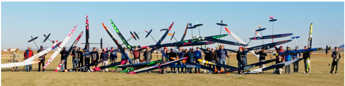
Southwest Classic F5J, Stanfield AZ, Feb 2021

Note: None of this Store's proceeds are directed to USA F5J World Championship teams. Team funds are generated via separate fundraising campaigns on a different website.