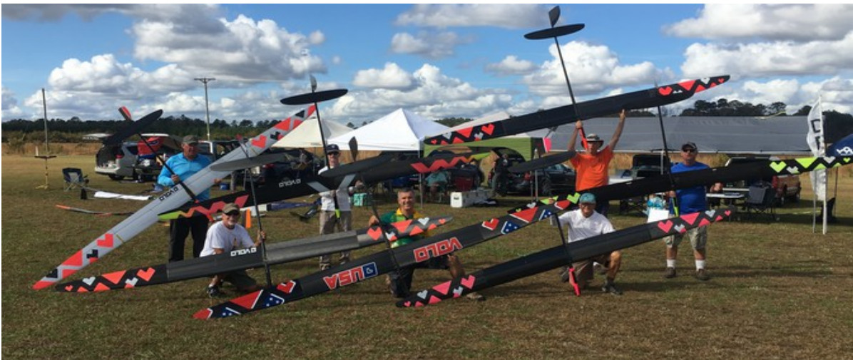
East Coast Fall F5J Festival, Farmville NC, Nov 2020