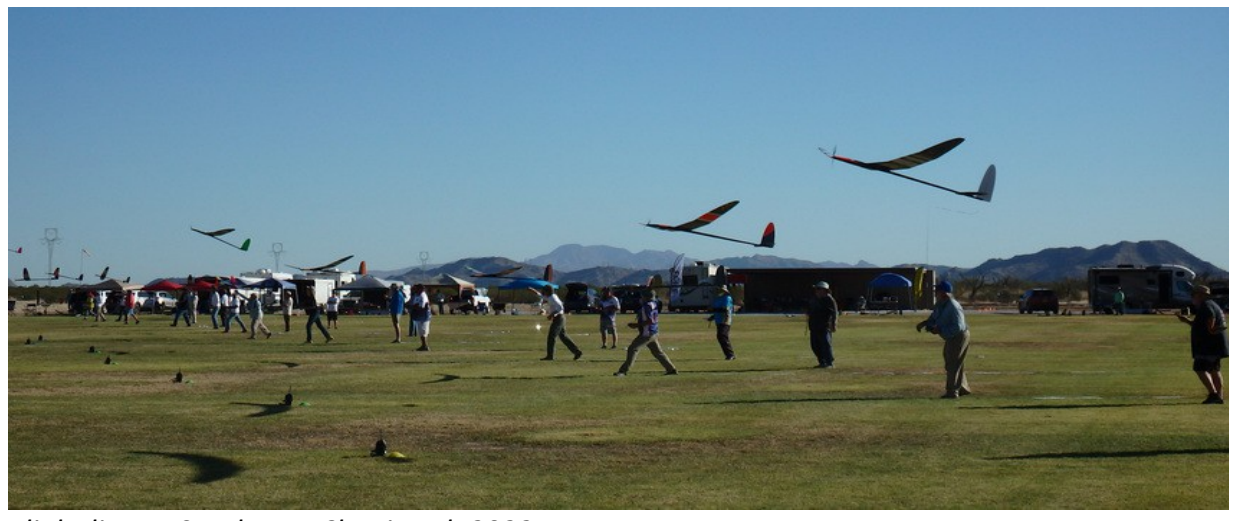
Flight line at Southwest Classic-Feb 2022

your team during signups. <u>NES</u> is hosting with organizer/CD Chris Bajorek . Tentative location is Perris CA, also possible at Visalia, to be confirmed soon.