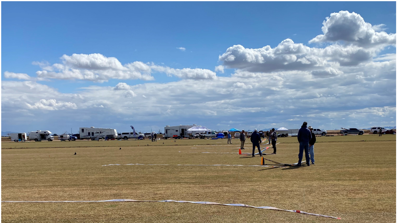
Flight line at last year's Southwest Classic F5J near Phoenix - Feb 2020

Other Tour events coming include a brand new Southern Cal F5J in Riverside CA on April 24-25, and both eastern and western events in early June.