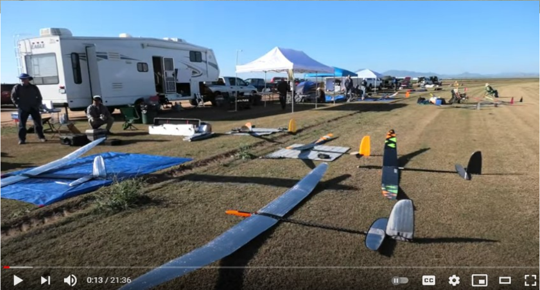
Classic 2020 video (click to view)