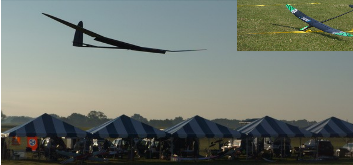
Pits at the NATS F5J