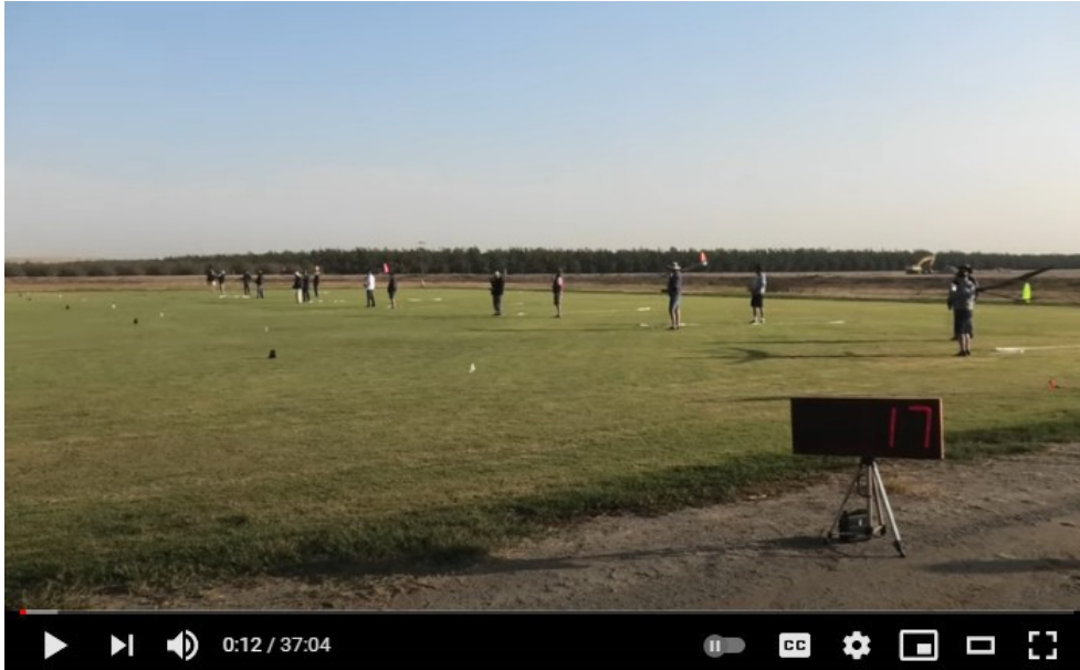
Video by Ali Khani - Click to view