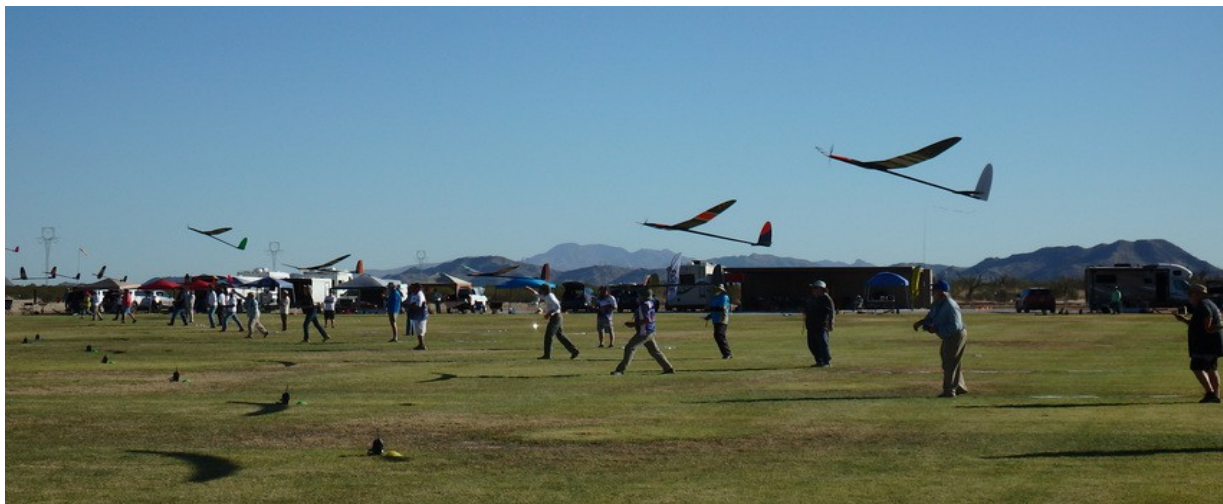
Flight line at Southwest Classic-Feb 2022